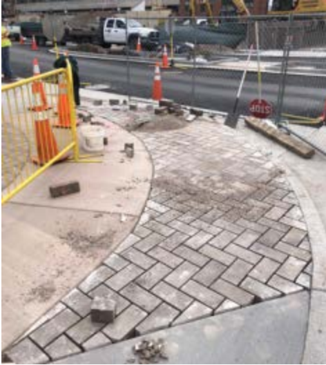
Paver installation at corner of Rio Grande Park.