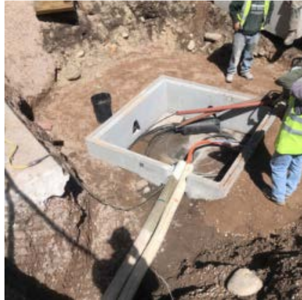
Additional Communications vault