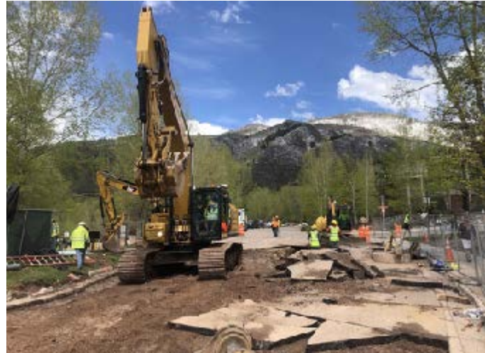
Street Work in front of Tasters Restaurant