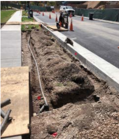
Landscaping per "Complete Streets Initiative"