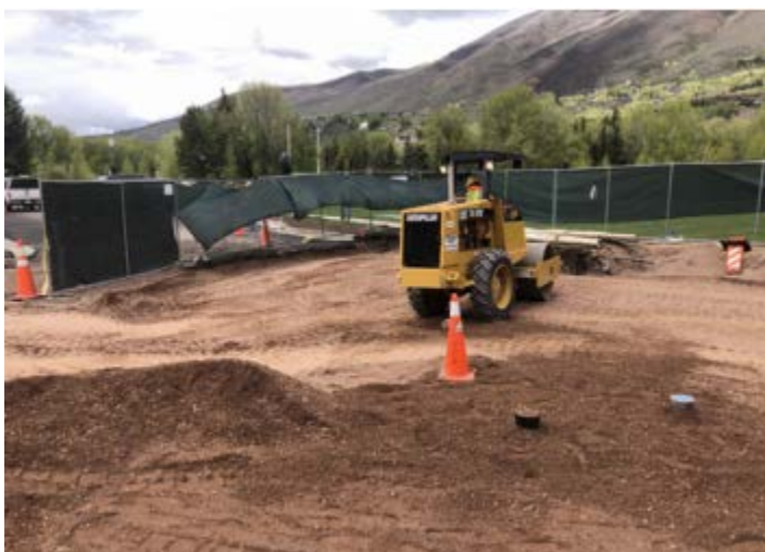
Compaction of Roadbase, Rio Grande Pl.