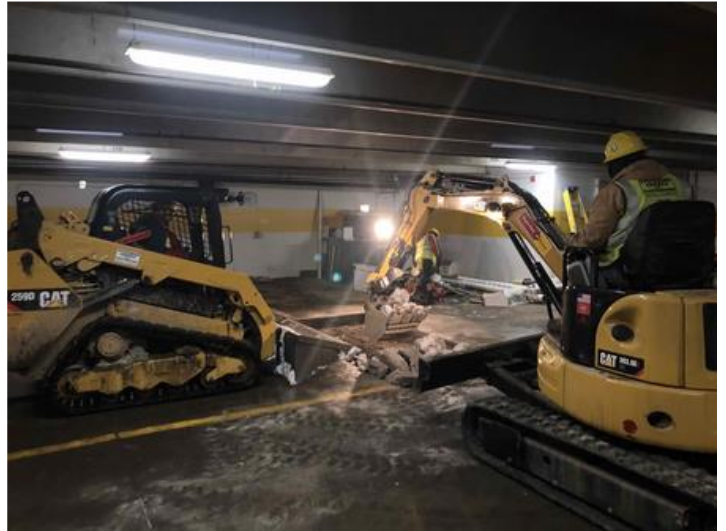
Locating the existing 24" storm pipe