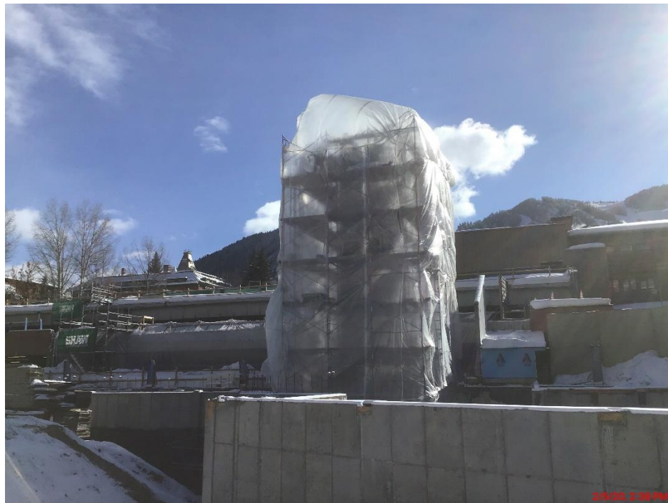
Elevator core with scaffolding