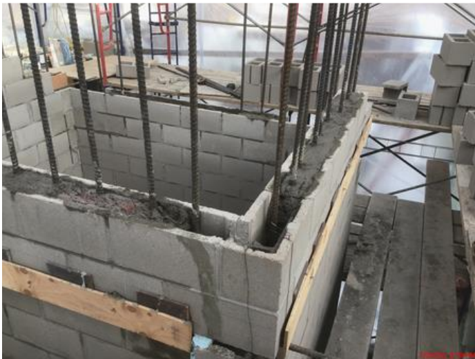
1st Grout lift for the ACO elevator core