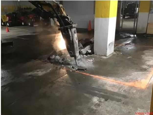
SOG Demo in the parking garage