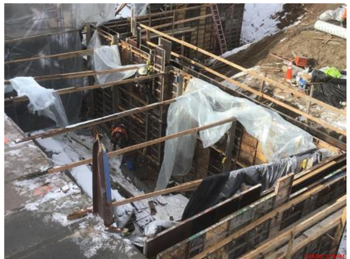
Finishing up the wall forms along Grid 3 & G