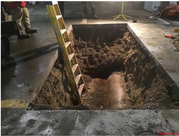
Locating the existing 24" storm pipe