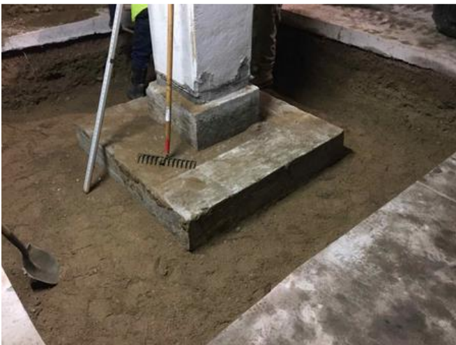
Existing column on gridline P6 ready for enlarged footing to be added