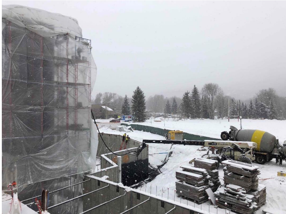
Elevator core with scaffolding