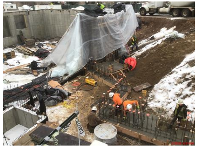
Continuous footings along Grid 3 & G