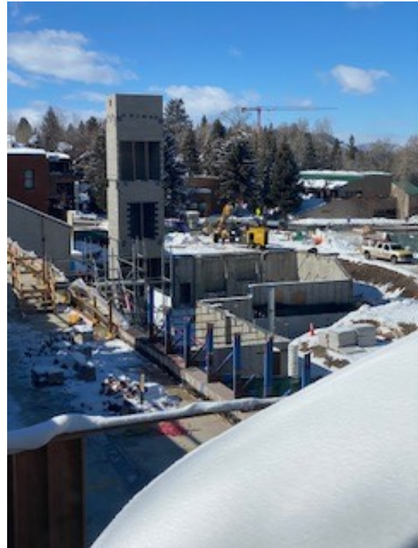
Completed elevator core