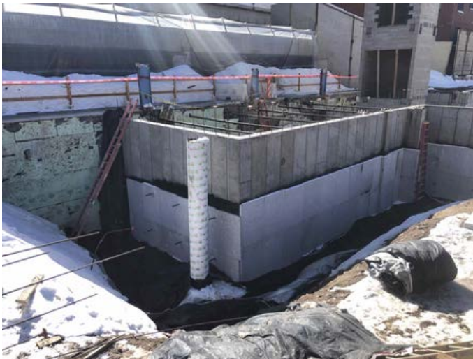
Lower half waterproofing & drainage board complete