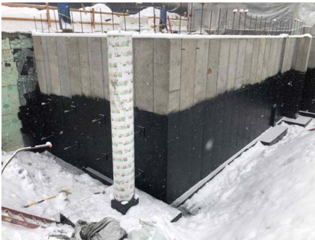
Waterproofing along GL 3