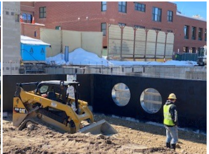
Underground duct prep