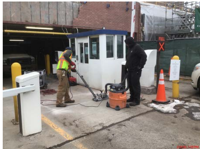
Pay station equipment being relocated