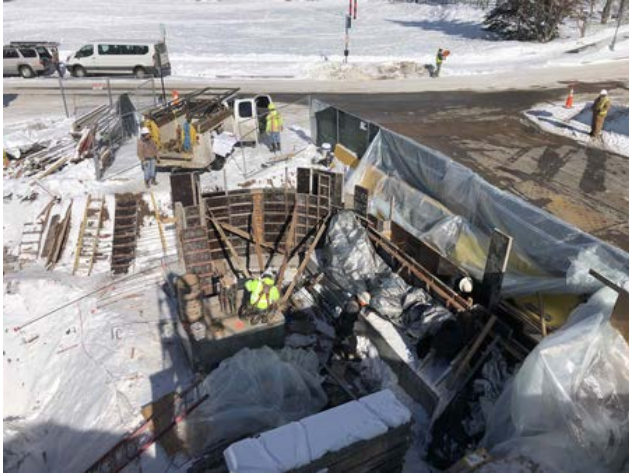
Stem wall poured along GL 1