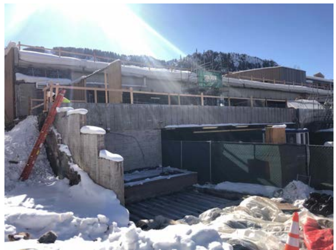
Brick & existing steel structure removal completed at the precast beam over the garage entry.