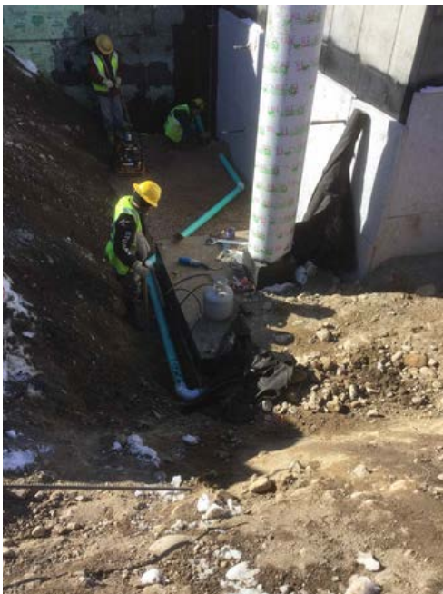
Install of perimeter drain along GL G