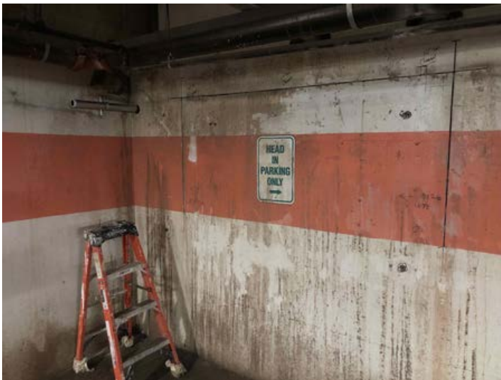
Cutting in of new doors at garage foundation wall