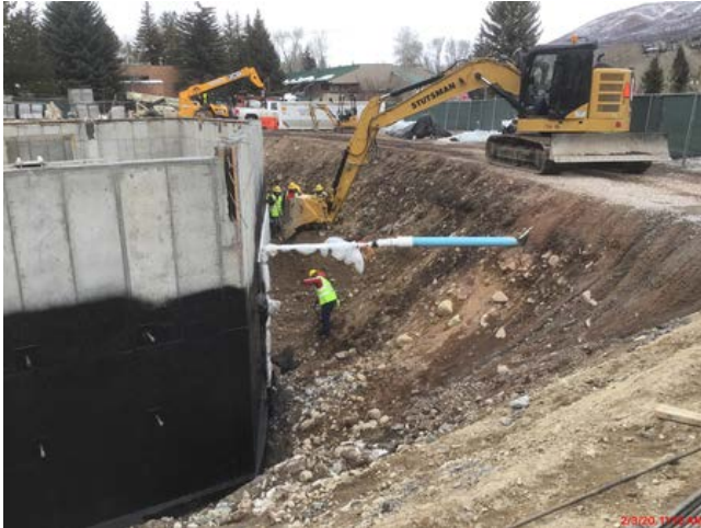
Foundation perimeter drain being installed