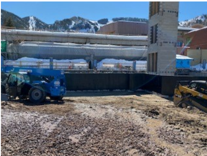
View of foundation looking at Ajax