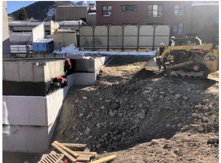
Backfilling progress against the west side of the foundation