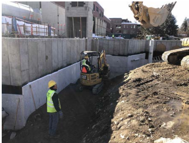
Backfill at installed perimeter drain