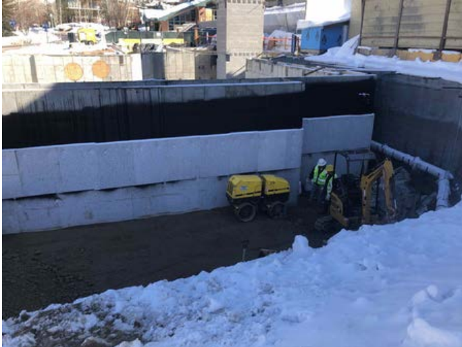
Backfilling against the west side of the foundation.