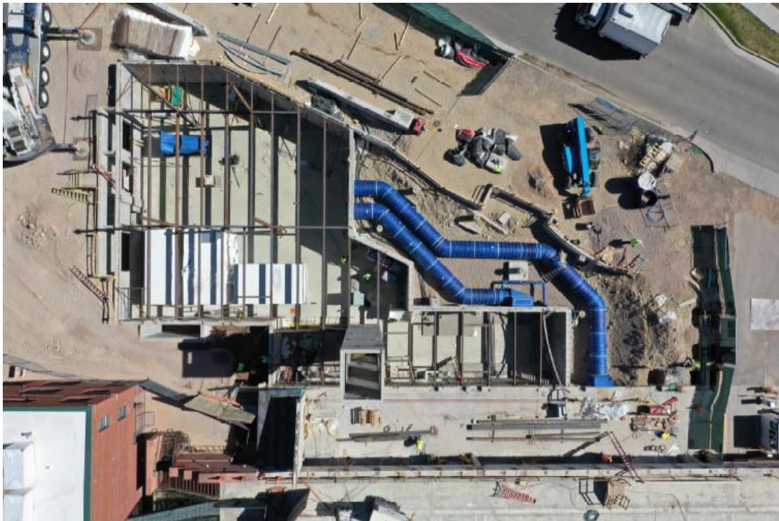
Drone Photo - Completion of the underground duct