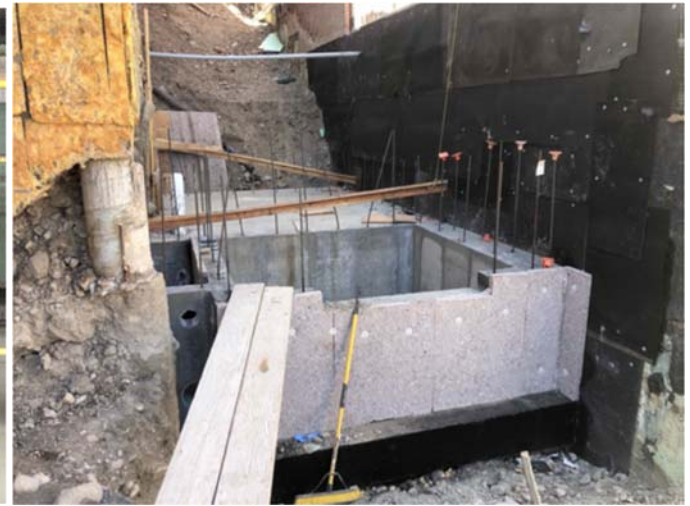
RGB elevator pit walls placed and waterproofed