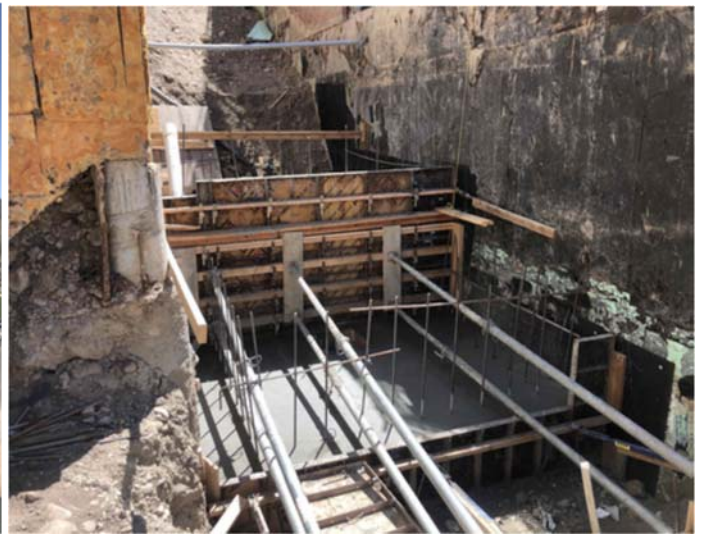
RGB elevator foundation