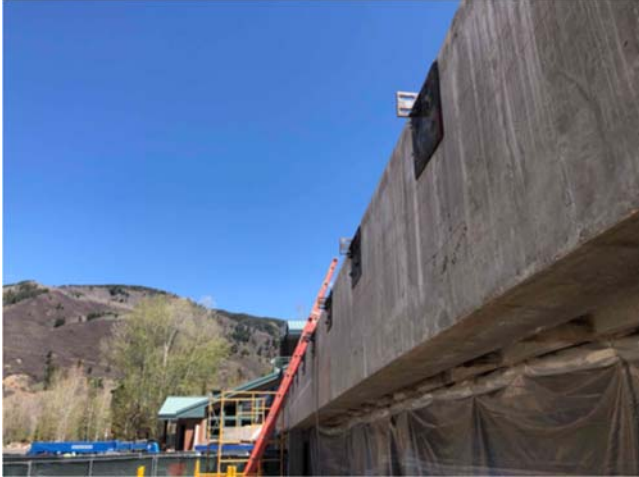
Plates installed to the parking garage in preparation for steel erection