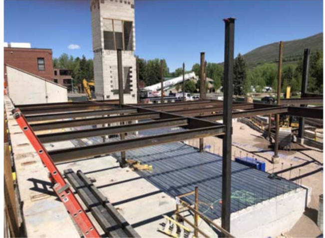
Middle level steel erection