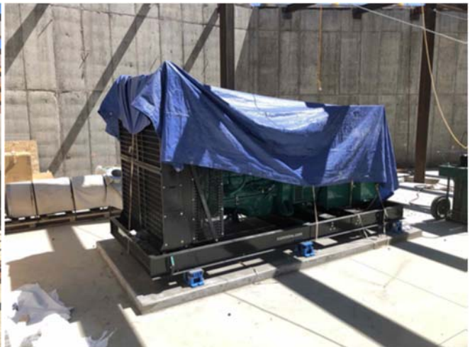
Backup Generator – Basement Mechanical Area