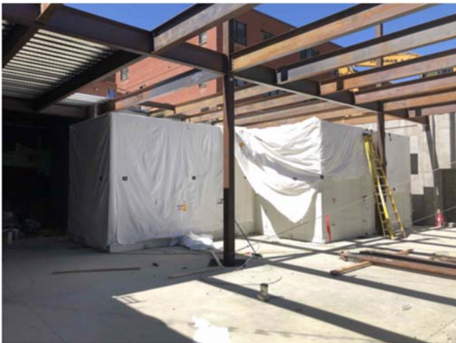
Air handling Unit – Basement Mechanical Area