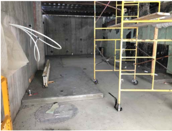
Equipment pads in mechanical room