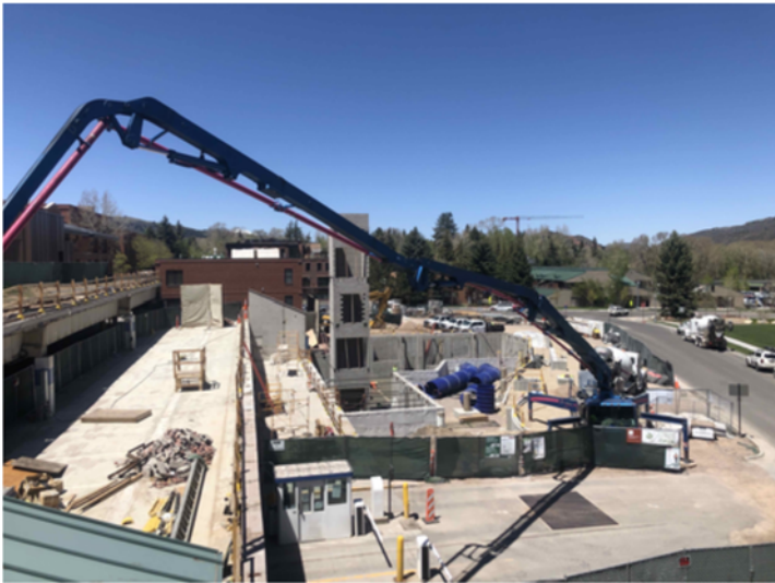
Placing the RGB elevator foundation